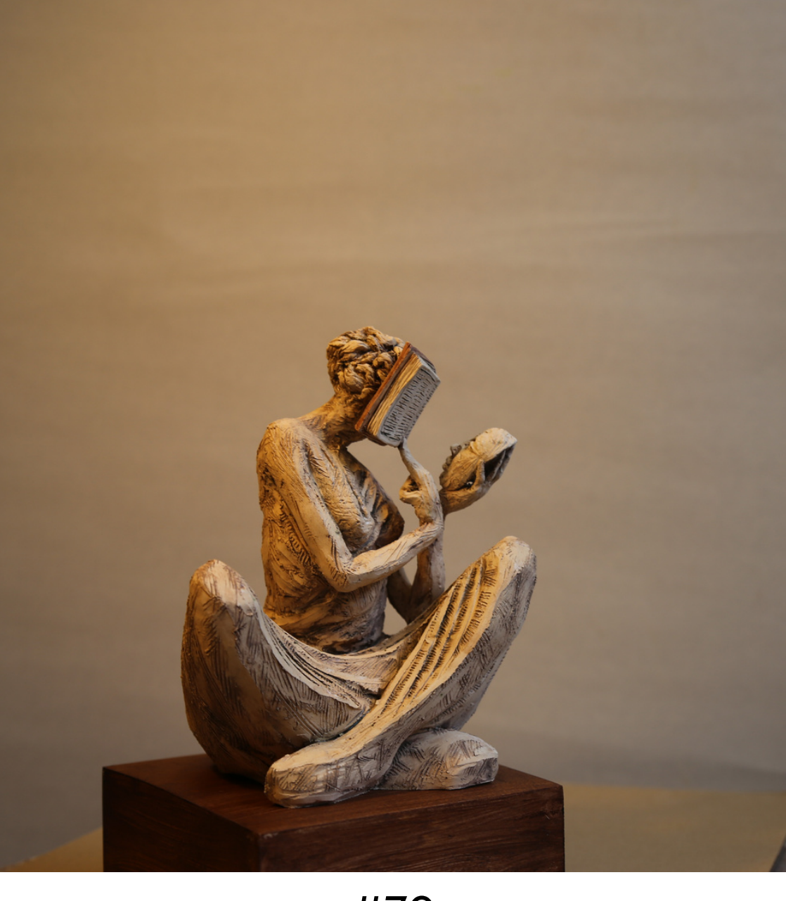
#79 €42 5