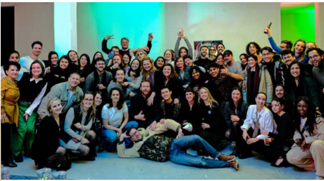
Justice & Peace 55-years celebration event.