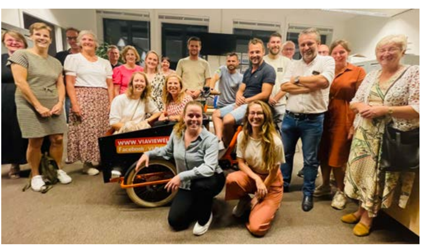
Sponsor groups from Rijssen-Holten attended the start training of Samen Hier organized by Justice & Peace.

De Thuisgevers posted a news item on their website, which you can see via: <a href="https://dethuisgevers.nl/nieuwsitems/de-thuisgevers-coa-jusitce-and-peace-viavie-welzijn-en-gemeente-rijssen-holten-werken-samen-voor-goede-start/">https://dethuisgevers.nl/nieuwsitems/de-thuisgevers-coa-jusitce-and-peace-viavie-welzijn-en-gemeente-rijssen-holten-werken-samen-voor-goede-start/</a>