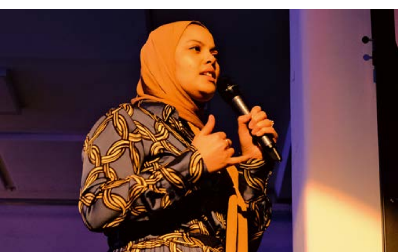
Justice & Peace 55-years celebration event.