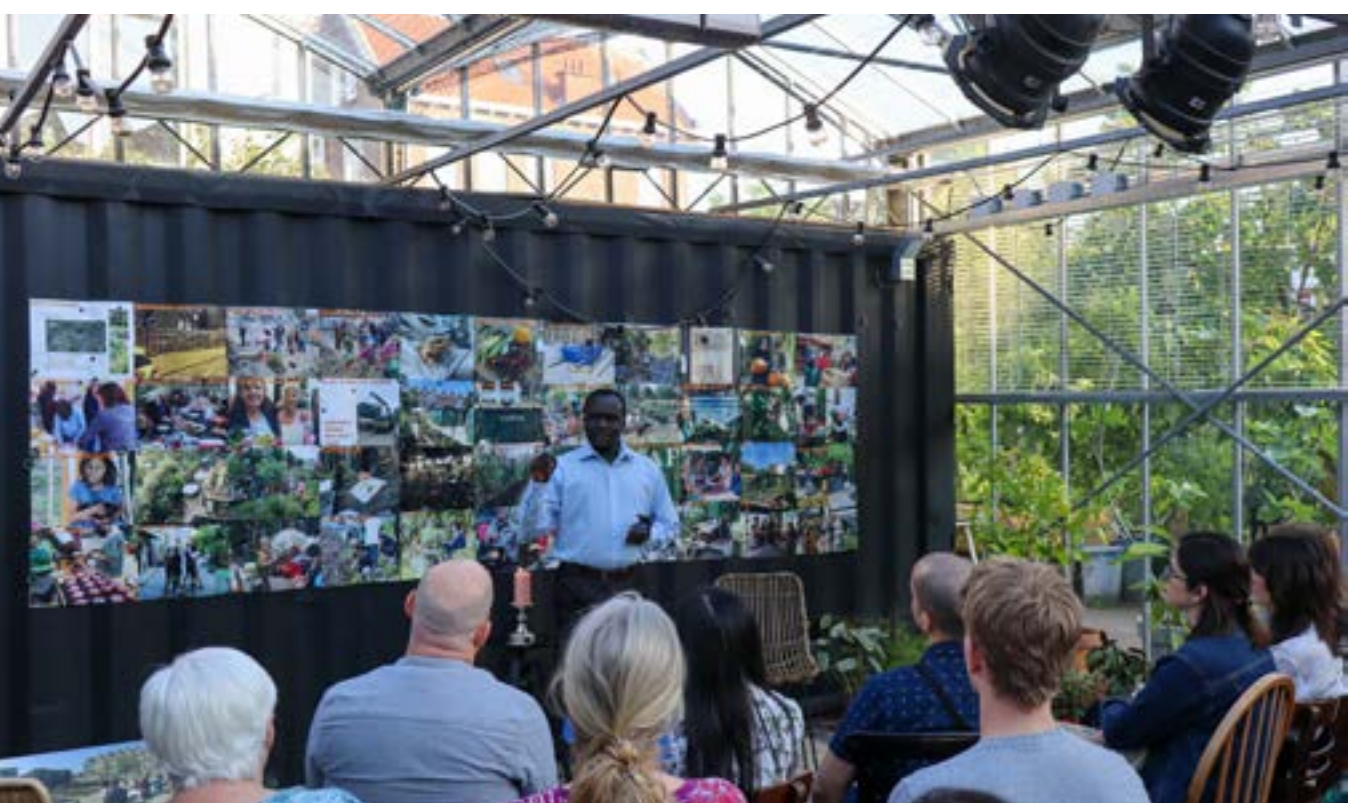
Shelter City guest speaking at a storytelling event of DISC.

This way, more human rights defenders have access to temporary relocation in the Netherlands, elsewhere in Europe, or in the region in which they work.