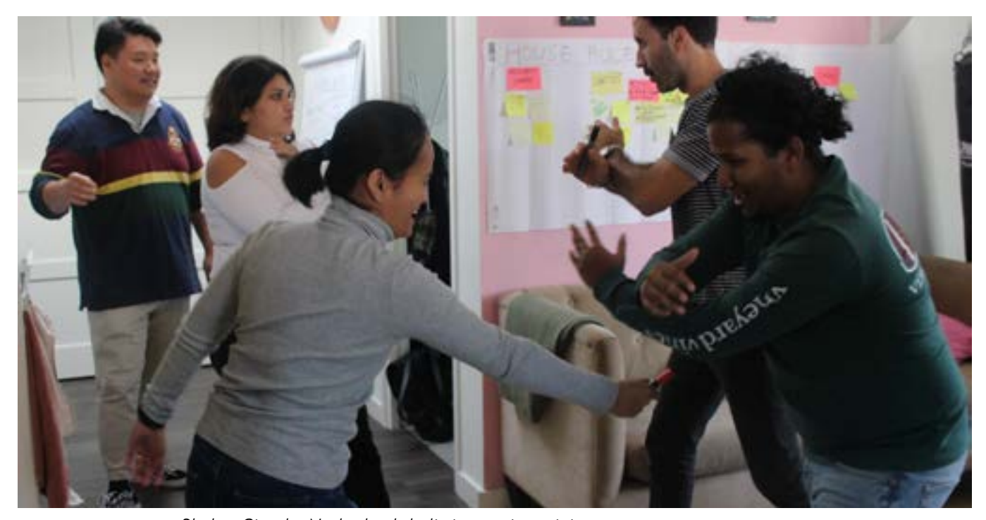
Shelter City the Netherlands holistic security training.

human rights issues and to learn to remain more resilient despite stress and pressure. In 2023, we organized in The Hague and other Dutch Shelter Cities a total of 24 in-person group training days for the human rights defenders staying in the Netherlands. Capacity building included knowledge and skills to effectively address human rights issues, such as public awareness raising, campaigns and advocacy, data literacy, human rights mechanisms, transitional justice, communications, networking, and fundraising. Furthermore, topics relevant to strengthening resilience included digital and physical security, self-care, trauma sensitivity and self-defense.