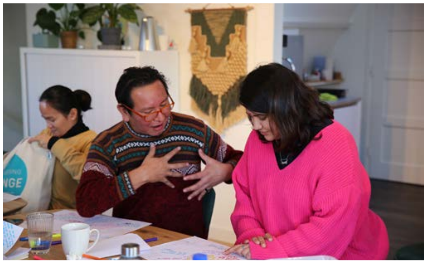
Shelter City the Netherlands holistic security training.

For human rights defenders, participating in Shelter City means an opportunity to increase their capacities to address challenging