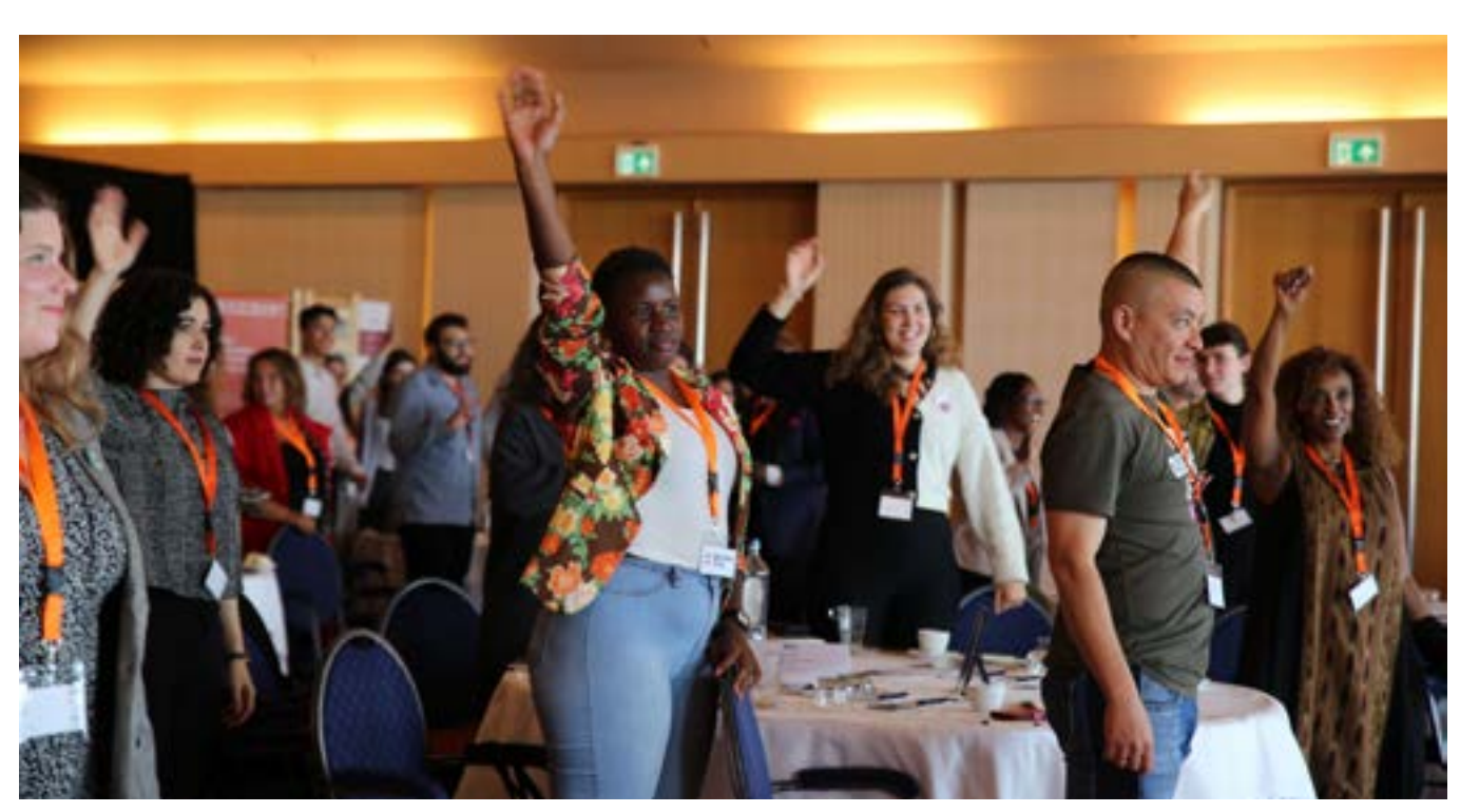
Shelter City international partner meeting in The Hague.

During the Shelter City Global Partner meeting in October 2023 "From Africa to Europe: Enhancing global collaborations to protect human rights defenders at risk", a significant milestone was achieved with signing the memorandum of understanding between DefendDefenders and Justice & Peace. This agreement formalized areas of collaboration between the movement of Shelter Cities (worldwide) and Ubuntu Hub Cities (Africa). This meeting provided an invaluable opportunity for our African partners to engage in cooperation with the broader temporary relocation network in Europe. Through open dialogue and interactive panel discussions, partners sought to enhance the effectiveness of the Shelter City Initiative in responding to the evolving needs of human rights defenders at risk. We focussed on issues like access to visas, longer-term relocation and building stronger protection mechanisms together for human rights defenders at risk.