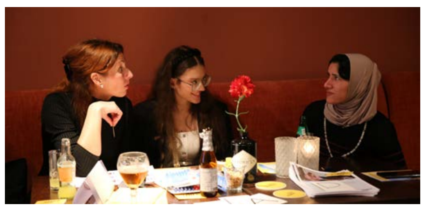
Samen Hier community event in The Hague

Multi-annual goal 2: Influence public perception of human rights and enhance people's perspective for action in the protection and promotion of human rights.